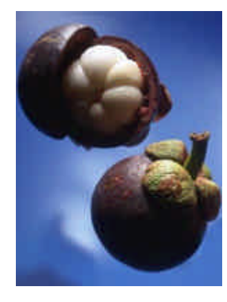
Mangosteen "Queen" of Tropical Fruits