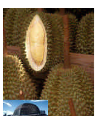
Durian "King" of Tropical Fruits