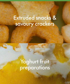
Extruded snacks & savoury crackers