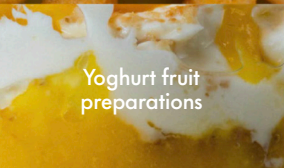
Yoghurt fruit preparations