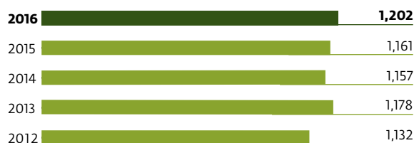
Sales: Flavour Division in millions of Swiss francs

Sales across North America increased 0.4% on a like-for-like basis. New wins and growth of existing business in Dairy, Savoury and Sweet Goods were offset by lower sales in the Beverage segment, which had seen strong growth in the prior year.